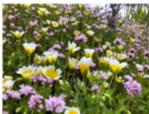
NATIVE POLLINATOR SEED MIX