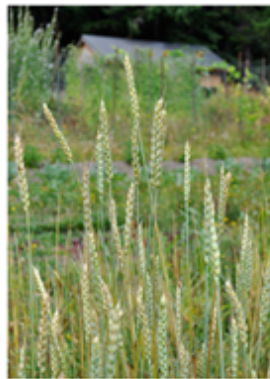
White Australian Wheat