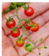
2 Wild tomatoes from Andes and Galapagos Islands