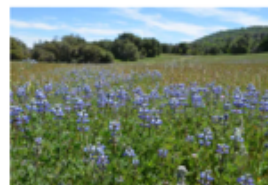
BICOLOR LUPINE SEEDS (LUPINUS BICOLOR)

Adaptive Seeds, Sweet Home, Oregon, https://www.adaptiveseeds.com/seed-tag/new-returning/