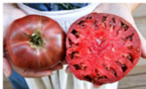
2 Delicious Russian heirloom varieties, 80-90 days,