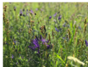
NORTHWEST PRAIRIE MIX

Of note is their lawn alternatives mix - in my opinion, none of the others on the market match theirs - and when we read the glossy UK gardening