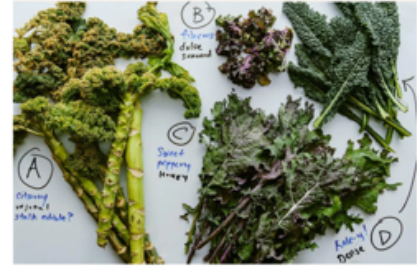
Growth trial notes

Salt Spring Seeds is one of our oldest local seed growers and arguably the most progressive. Dan Jason grows and preserves seed from over 600 heirloom