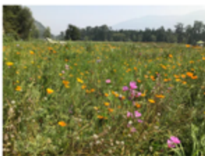
DEER DEFENSE SEED MIX