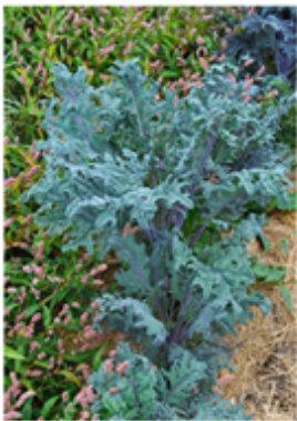
'Purple Peacock' Broccoli