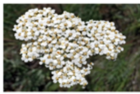
WESTERN YARROW SEEDS (ACHILLEA MILLEFOLIUM)