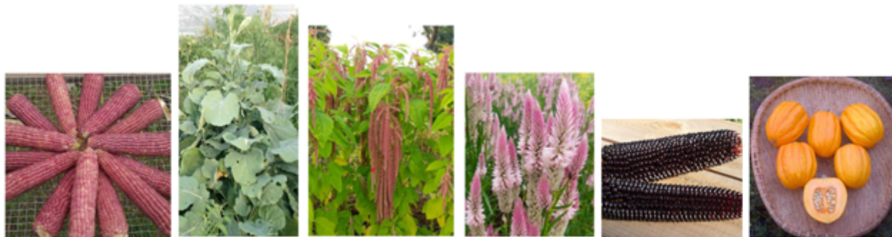
pink popcorn 'Southerland' 'Coral Fountain' celosia black popcorn 'Golden Pippin' squash

Because we don't have the heat or long growing season of southern areas, Vancouver gardeners have been challenged to get some vegetables like large heirloom tomatoes, melons, and sweet potatoes to ripen and develop full flavours.