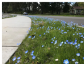
NEARLY NATIVE BEE LAWN SEED MIX