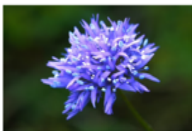
GLOBE GILIA SEEDS (GILIA CAPITATA) $6.50