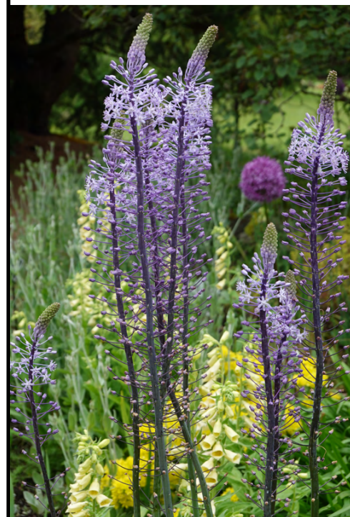
Visnja Gasparic Vojvodic, Richmond Garden Club

Indigenous people of the Pacific Northwest actively managed and cultivated blue camas. It was an important food source and also acted as a physical boundary marker. Camas bulbs were pit-cooked and tasted like baked sweet potato. Eating too many baked bulbs caused excessive flatulence, especially if undercooked!