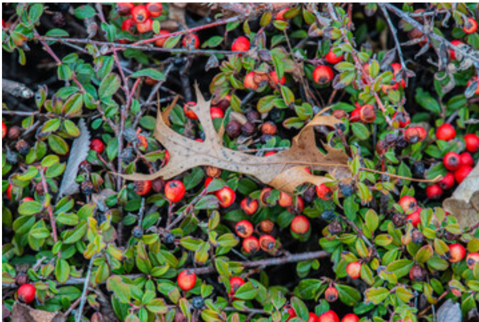
Brown Elfin and Kinnikinnick