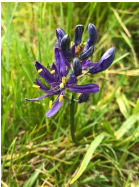
Jane Timmis, Gibsons Garden Club

To continue with our theme of planting purple to support the Canadian Garden Council and Communities in Bloom inviting us to plant purple in 2023, we are featuring some photos from our members of Camassia , Indian hyacinth, camas, wild hyacinth.