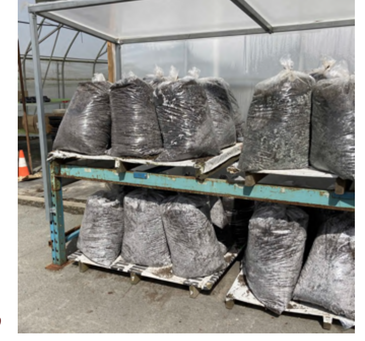
Cow 12 kg - $5