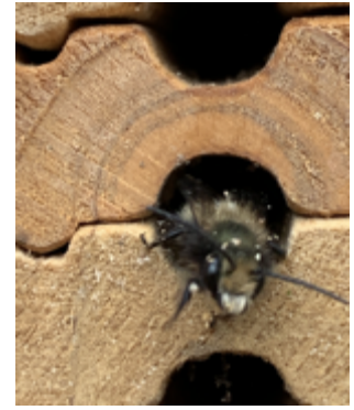
cleared and this little bee.