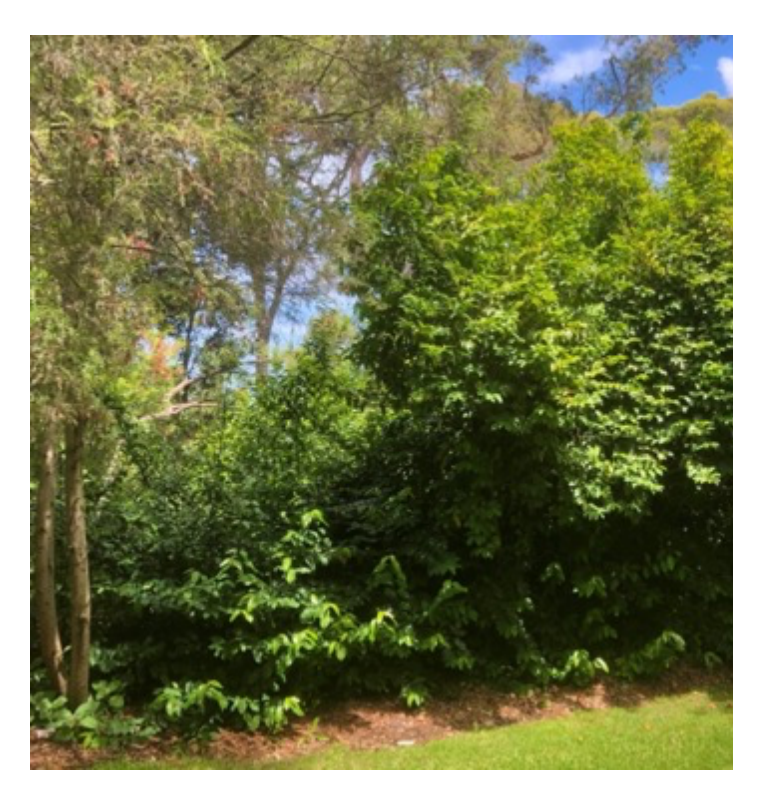
Plate A. Mature Bolwarra shrub in the Maranoa Botanic Gardens in Melbourne.

Part of the intrigue of Bolwarra is its unique reproductive biology, involving asexual and sexual reproduction, and its highly specific symbiotic relationship with small weevils in the genus Elleschodes .