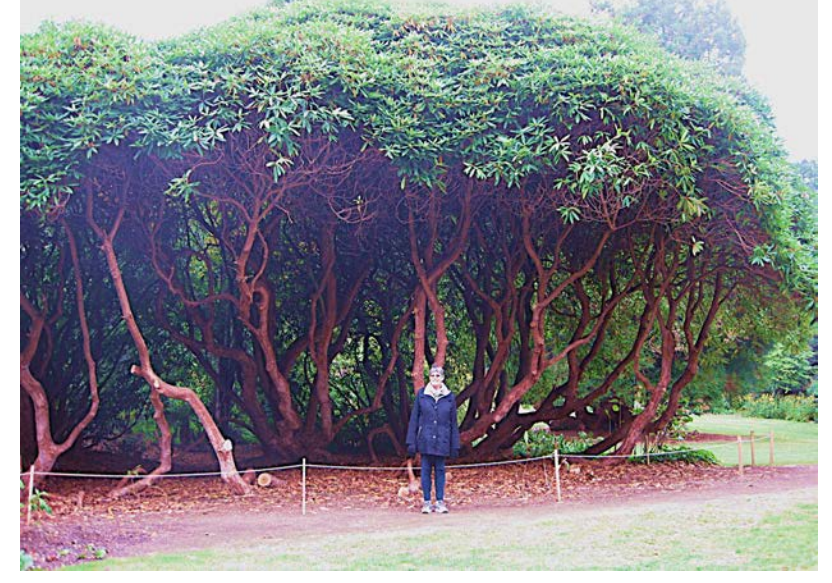
you're impressed by my knowledge of the names, I used my photos to reverse image search on Google - you can do it